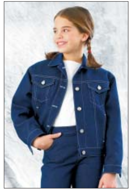
Girls' and boys' jeans jacket has front button closure, front and back yokes, pockets in front yoke seam with button flaps, three-panel front and back, pockets in front side panel seams, two-piece sleeves with button cuffs, and waist band with button tabs.