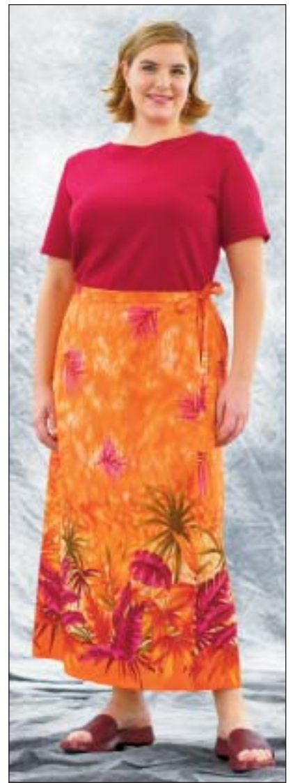
Shown with Top 2836

Women's wrap skirts in two lengths have waistbands and darts in front and back. View A has ties at waist and one inside button. View B has two-button closure on waistband.