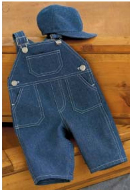
Baby bib overalls and hat. Overalls have fake fly, patch pockets on front, back, and bib, shoulder straps with buckles, side openings with button closure, and snaps on inside legs. Five-panel hat has brim and elastic in back.