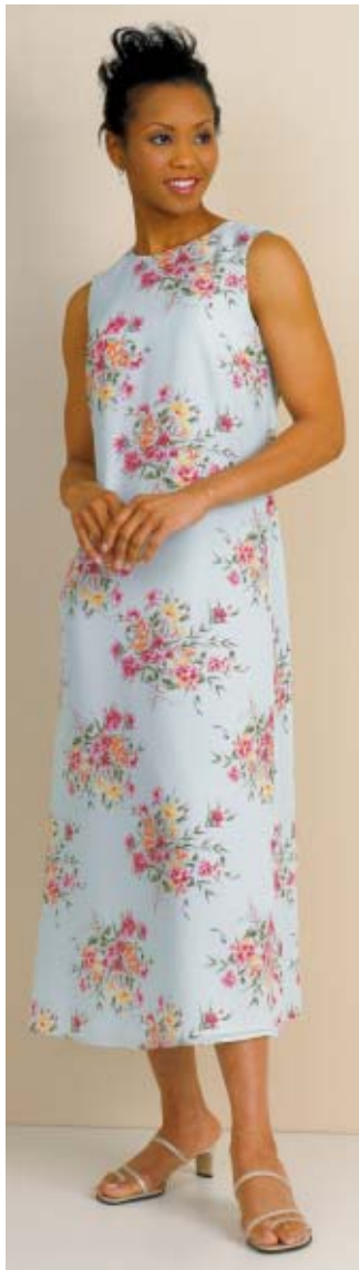
Misses' pullover, slightly A-lined dresses are lined and have narrow ties in side seams that tie in back. Views A & B have scoop necklines. View C has jewel neckline and back slit with button and loop closure.