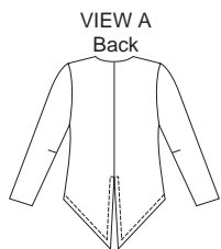
VIEW A Back