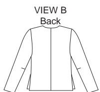
VIEW B Back