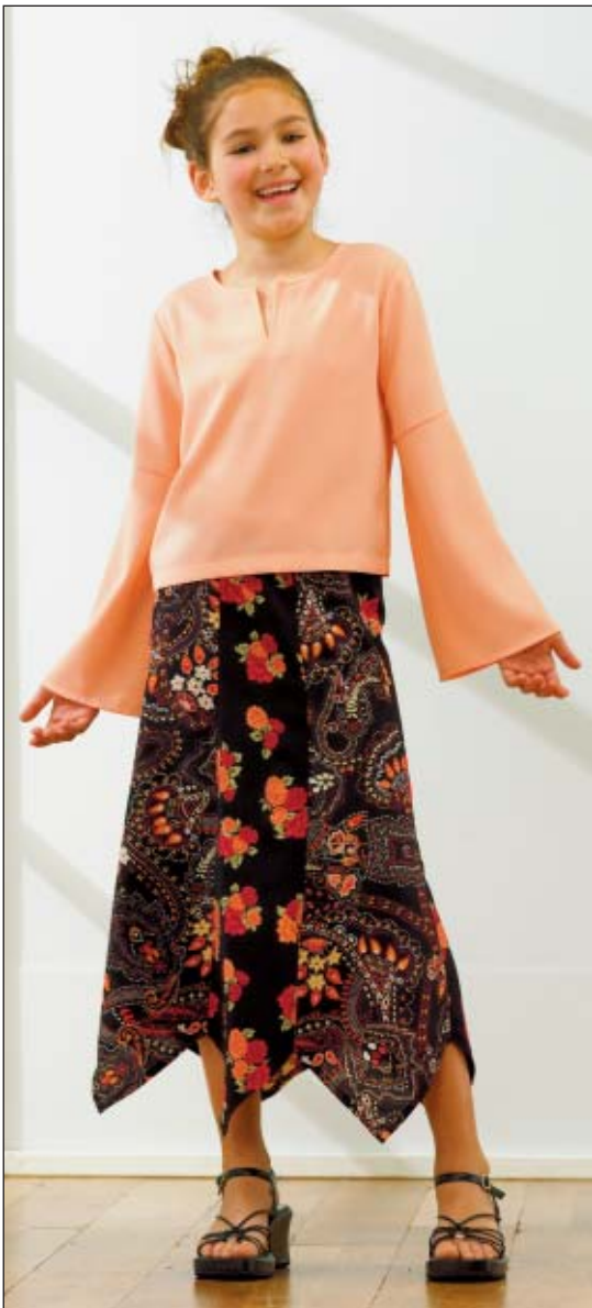
Girls' tops and skirts. Pullover tops have front slits and necklines finished with bias-cut bindings. View A has flared sleeves. View B has three-quarter length sleeves. Flared eight-panel pull-on skirts have elastic in casing at waist. View A is made from two different fabrics and has shaped hemline with eight points. View B is made from one fabric.