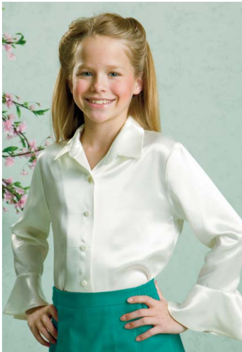
Girls' blouses have collar and stand in one. View A has decorative front and back yokes, front tabs, snap closure, pockets with flaps, and full-length sleeves with cuffs. View B has front tab, button closure, short sleeves, and one pocket. View C has fold-back facings, button closure, and three-quarter length sleeves with flounces.