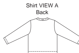
Shirt VIEW A Back