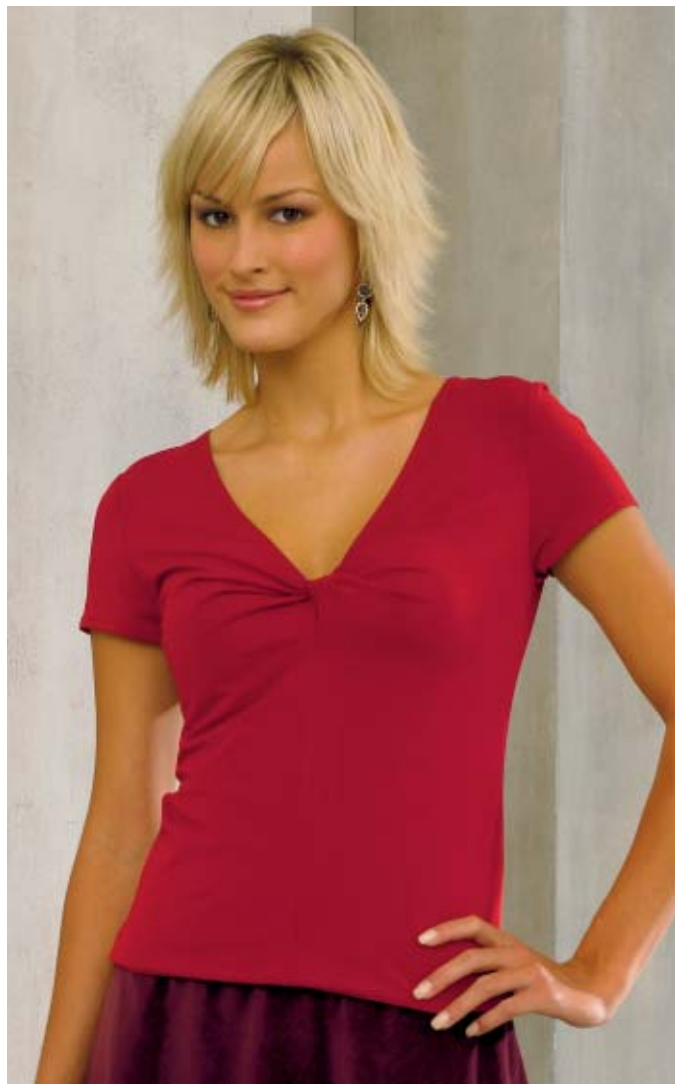
Misses' close-fitting pullover tops have twist fronts and deep V-neckline finished with narrow hem. View A has full-length sleeves. View B has three-quarter length sleeves and is cropped. View C has short sleeves.