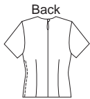
TOP VIEW A