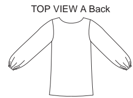
TOP VIEW A Back