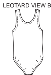
LEOTARD VIEW B