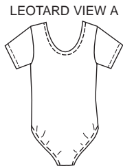
LEOTARD VIEW A