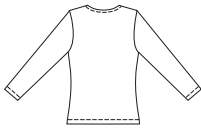
TOP VIEW A Back