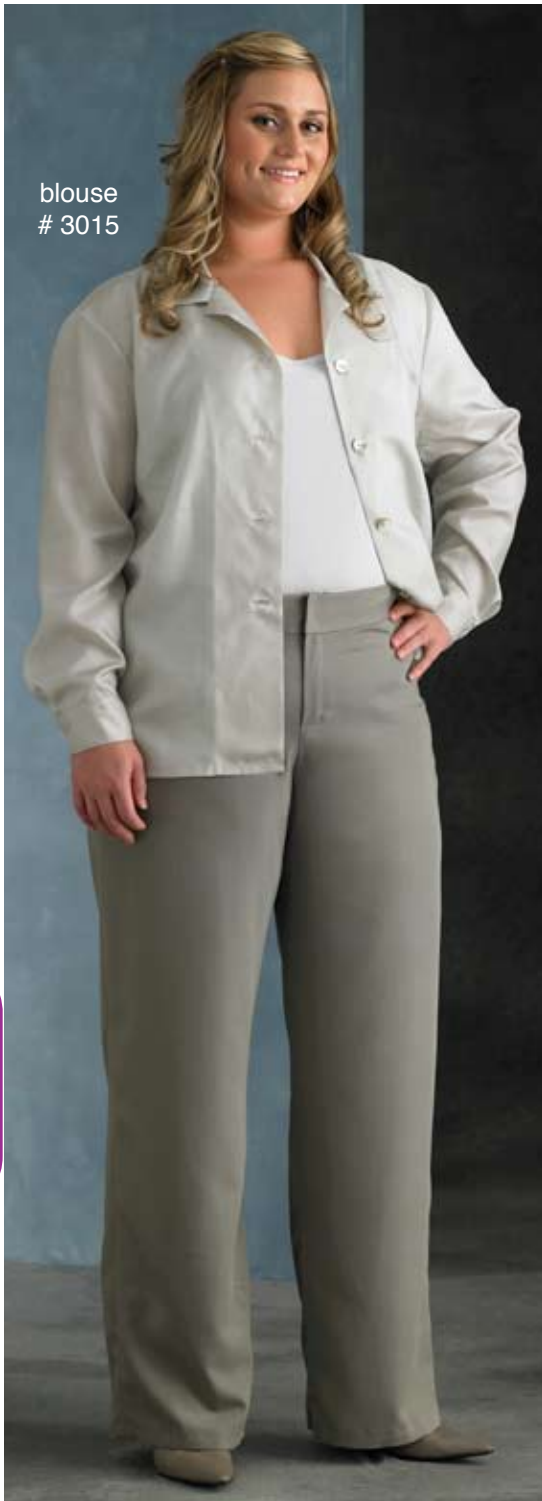
blouse # 3015

Women's pants can be made with straight wide legs or slightly tapered legs. View A fitted pants have front fly zipper, fits slightly below waist, and has shaped waistband. View B pull-on pants have elastic in casing at waist.