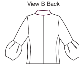
View B Back