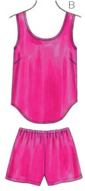
WOMEN'S SLEEPWEAR 1X-2X-3X-4X