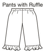
Pants with Ruffle