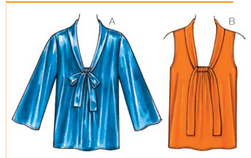
MISSES' TOPS XS-S-M-L-XL

Designed for lightweight woven fabrics. Suggested Fabrics: Silk, silk types, charmeuse, batiste, challis, lawn, georgette, rayon & blends.