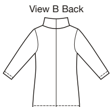
View B Back