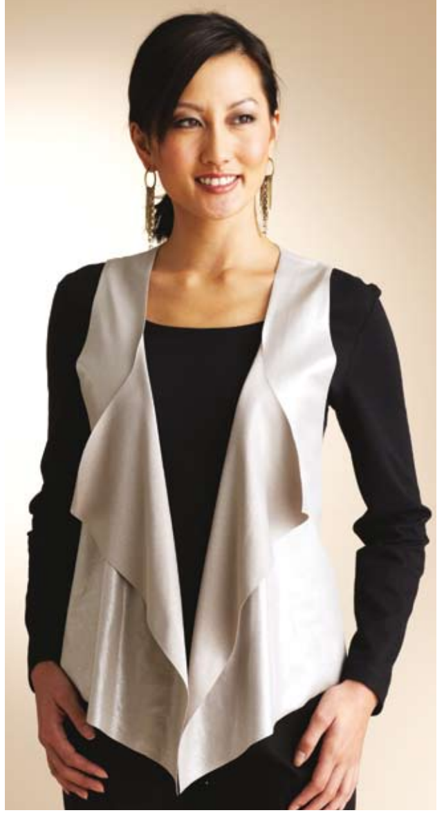
Designed for soft knit and woven fabrics. Suggested Fabrics: Suede cloth, sweatshirt fleece, Polarfleece®. NOTE: Wrong side of fabric will show.

Single layer vests have shaped bottom edge and all outer edges are left unfinished or can be finished with machine stitches. View A front edges extend and drape. View B has hood. Vests are easy to make and have special easy to follow instructions.