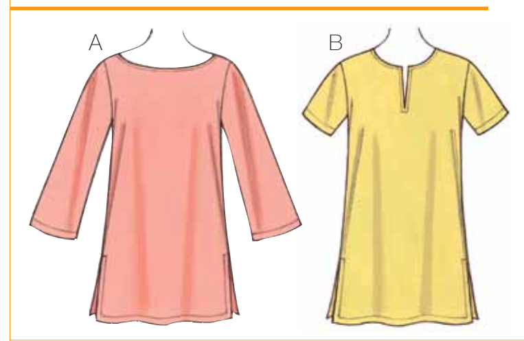
MISSES' TUNICS XS-S-M-L-XL

Designed for lightweight woven fabrics. Suggested Fabrics: Cotton, cotton types, lawn, batiste, chambray, challis, calico.