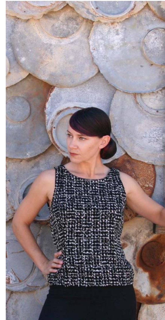
Multi-sized Petite through Plus